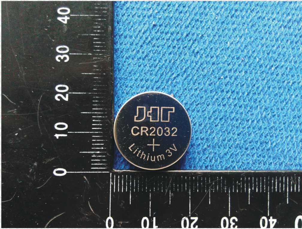
Cell (CR2032 3.0V 220mAh)